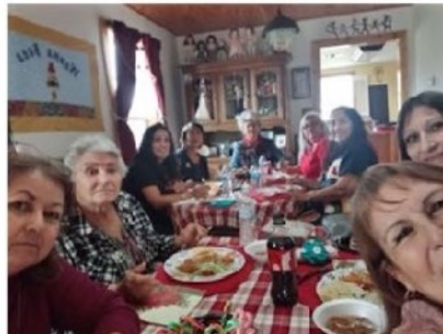
All Wanna Bees enjoying the Christmas Feast!