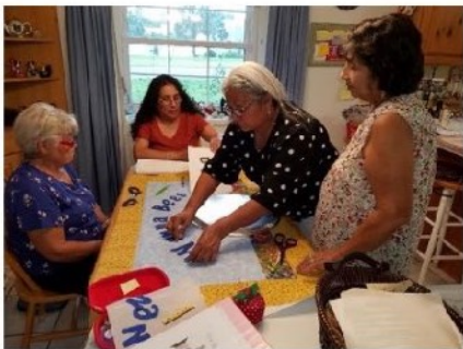
Wanna Bees busy buzzing creating the Banner!