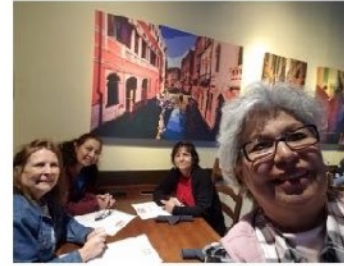
Wanna Bees ending CC trip with dinner.