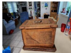
Dale quilting on Diana lectures on the Gritzner, German made sewing machine special features and details to Wanna her featherweight. Bees present at retreat. Gritzner sewing machine dates to the late 1800s.