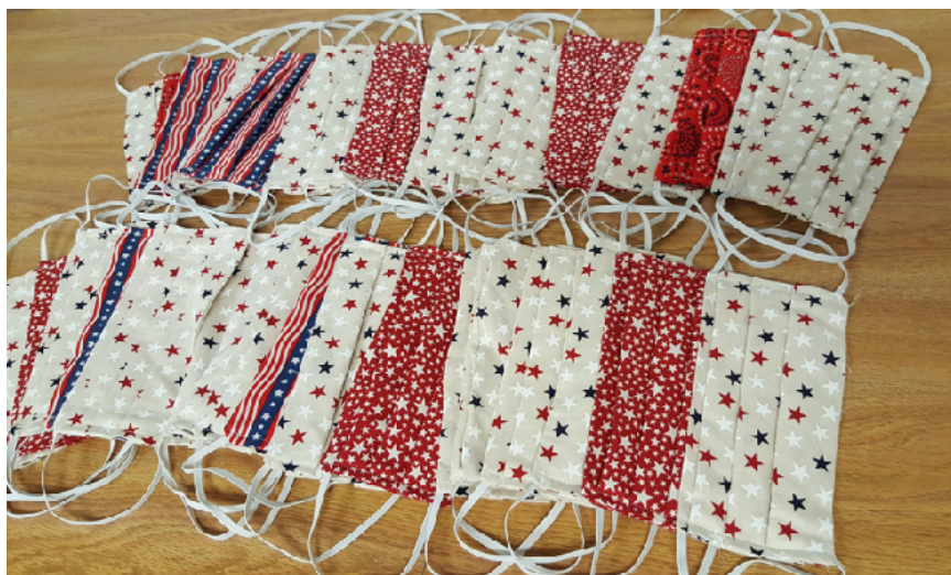
Masks Made For Veterans