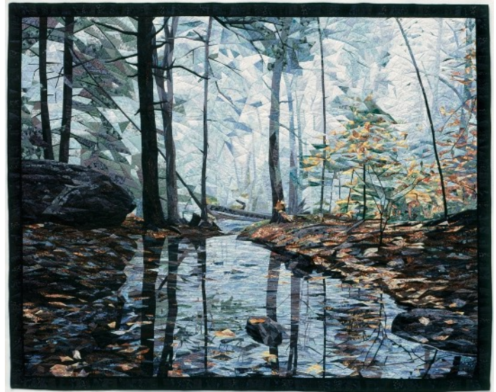
Piece and Quiet (62" x 78,") by Cynthia England, 1993. From the exhibit Picture Perfect: Quilts by Cynthia England .

subject of a special Museum Monograph, available for purchase.