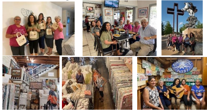
Our Bags to fill Lunch @ Los Laureles. The Empty Cross Up & down view of 2 story quilt shop. Audition @ Willie Nelson's