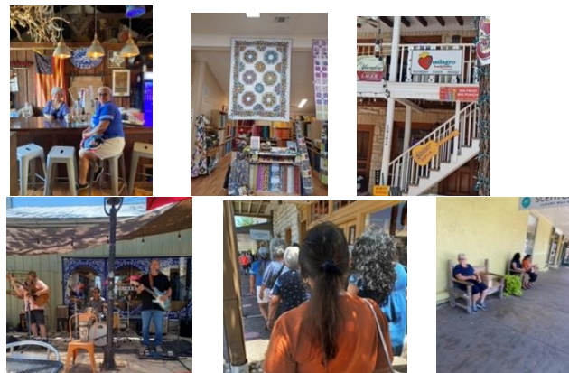
Willie Nelson Store Entertainment. Fabric joy. The Wanna Bees Walk. Lunch Stop. Lunch Day's end exhaustion!