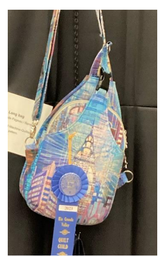
First – My Sling A Long Bag By Renee Pageau

WEARABLE: Clothing, jackets, christening gowns, skirts, vests, and accessories such as purses, bags, totes, shoes, slippers and hats.