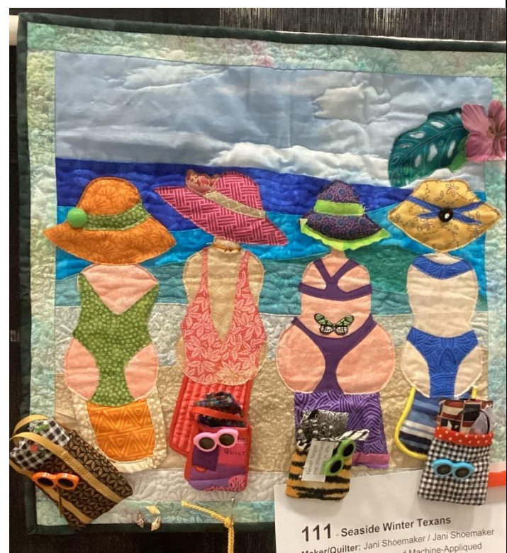
First – Seaside Winter Texans by Jani Shoemaker

SMALL WALL HANGINGS: This category includes ANY small entry that is pieced, embroidered, appliqued, whole cloth, hand and/or machine quilted specifically made to be <u>hung on a wall.</u>