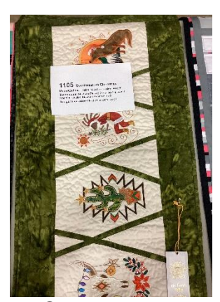
Southwestern Christmas By Thelma Woods