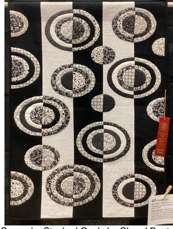
Second - Stacked Ovals by Cheryl Panter