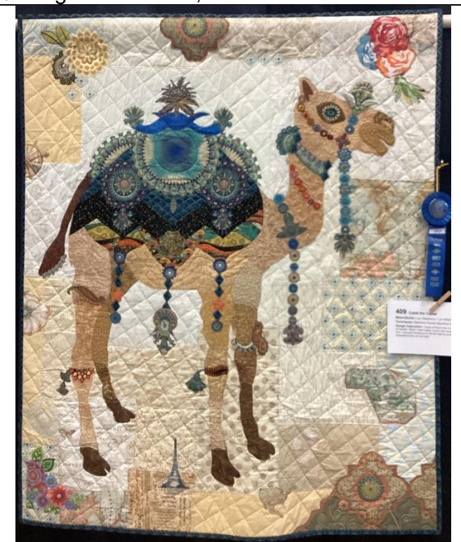
First – Caleb the Camel by Lyn Stephens

MODERN QUILTS: These quilts generally have the following characteristics: Simplified, abstract design; Use of solid fabrics, bold colors, large prints; Negative space is very important in the overall composition; Improvisational piecing may be employed.; Upcycled/recycled fabrics are often used; Quilting is restrained, often linear.