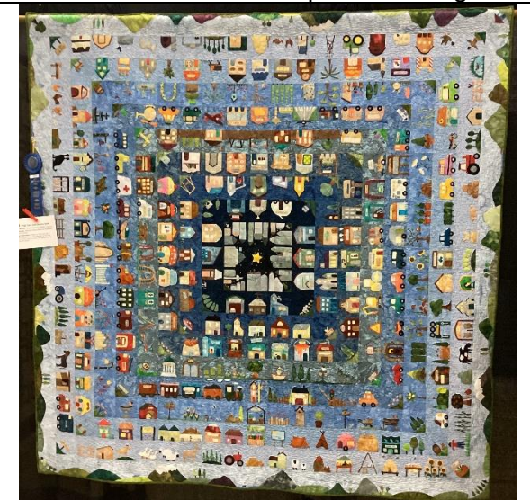
First – That Town and Country Quilt By Marge Lawrence

LARGE BED QUILTS: The perimeter is greater than 325 inches and less than or equal to 480 inches.