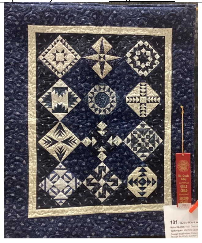
Second – 1920's Blue & White Mini Sampler By Vicki Guerra