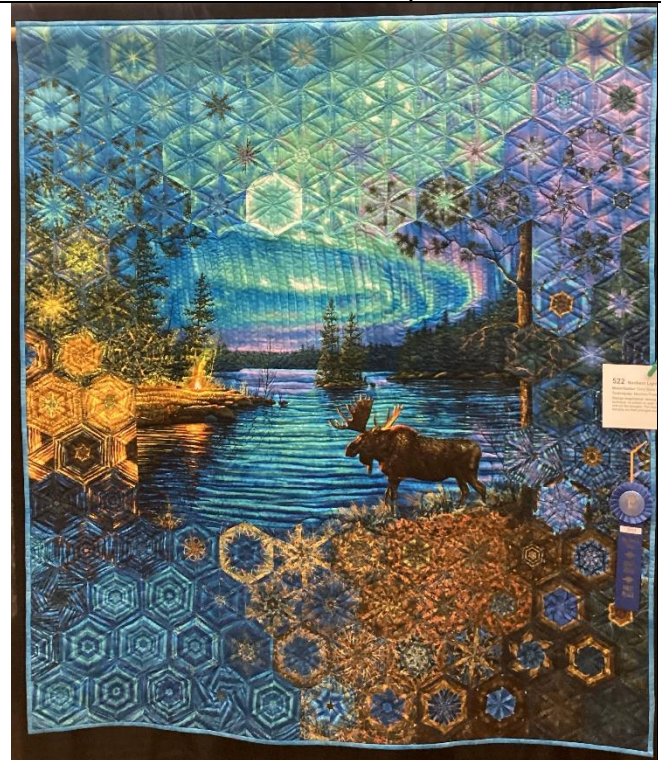
First - Northern Lights by Terry Davis

SMALL BED QUILTS: The perimeter is less than 250 inches.