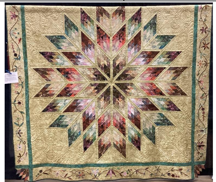
Second - Prismatic Star by Lyn Stephens