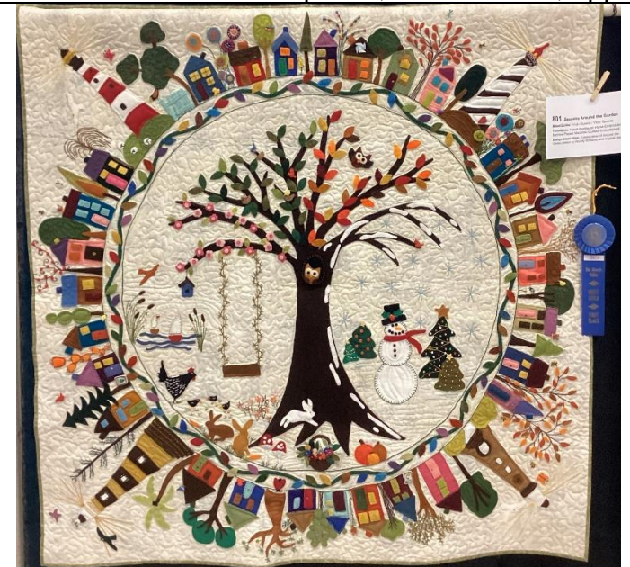
First – Seasons Around the Garden By Vicki Guerra

HAND WORK: HAND quilted, embroidered, applique, etc. Over 50% must be hand work.