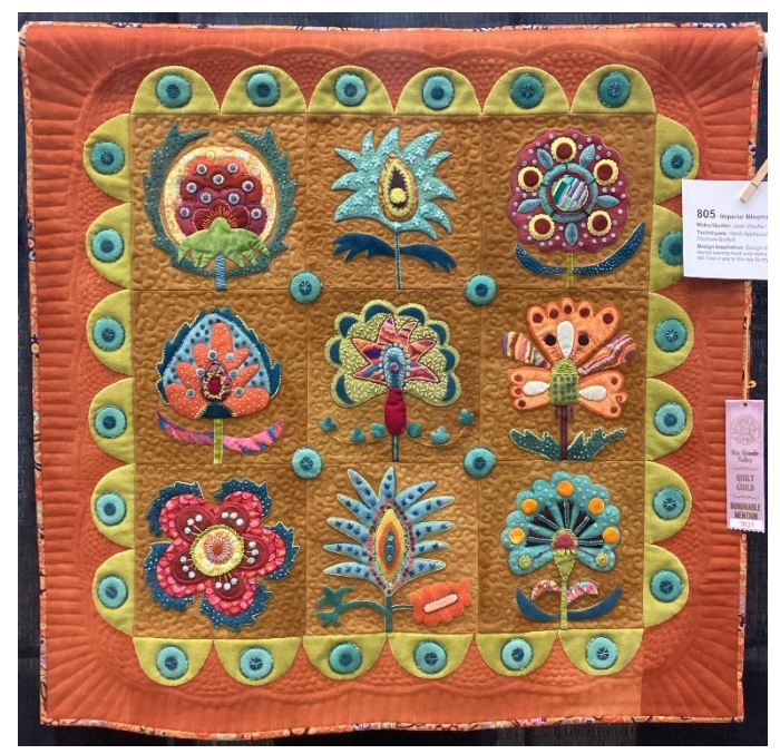
Honorable Mention Imperial Blooms by Jeannie Waufle