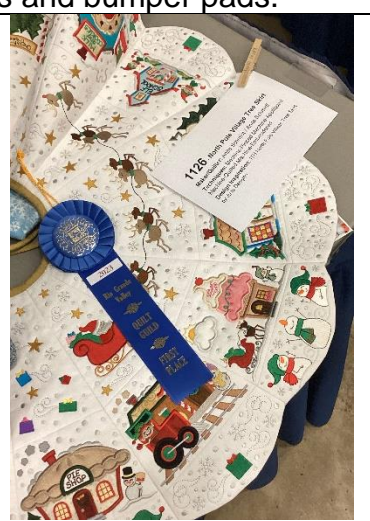
First – North Pole Village Tree Skirt by Anita Schmidt

HOME DECOR: Placemats, table runners, potholders, dolls, fabric bowls, and children's toys such as play mats and bumper pads.