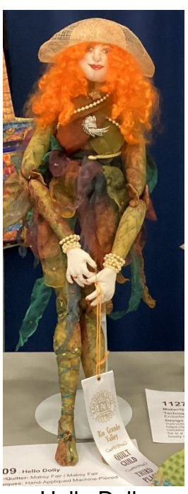
Hello Dolly By Mabsy Fair