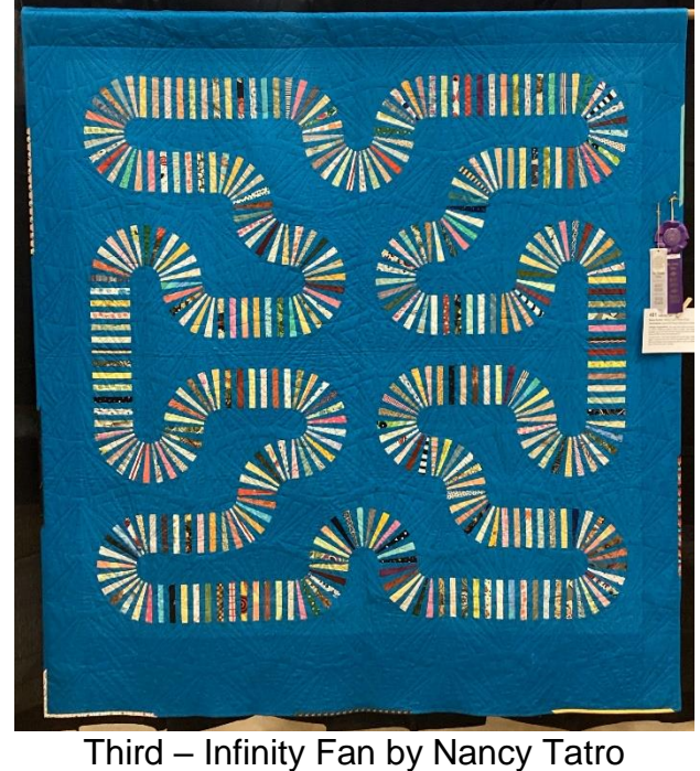
The Cares the Carrier by Lyn Ctophens