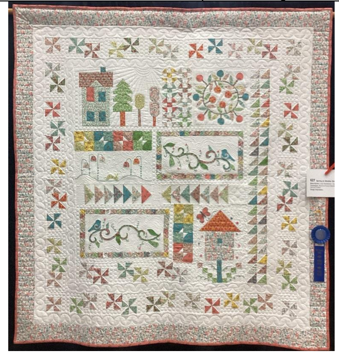
First – Spring on Bleeker Street by Judy Weitekamp

MEDIUM BED QUILTS: The perimeter is greater than 250 inches and less than or equal to 325 inches.