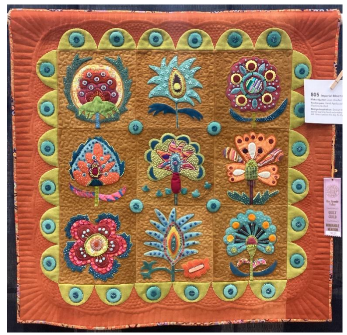
Honorable Mention Imperial Blooms by Jeannie Waufle