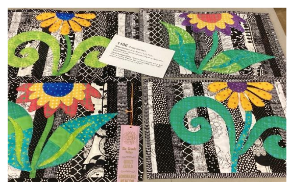
Honorable Mention Zesty Garden by Judy Blum