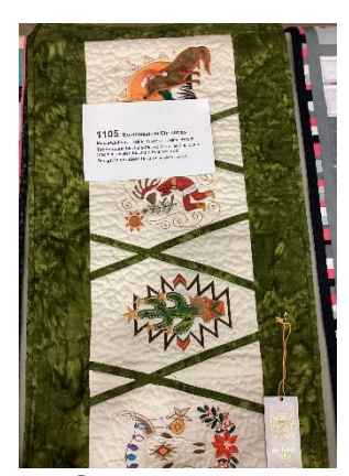
Southwestern Christmas By Thelma Woods