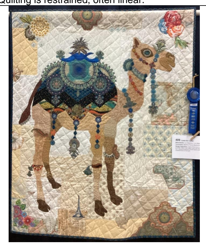
First – Caleb the Camel by Lyn Stephens

MODERN QUILTS: These quilts generally have the following characteristics: Simplified, abstract design; Use of solid fabrics, bold colors, large prints; Negative space is very important in the overall composition; Improvisational piecing may be employed.; Upcycled/recycled fabrics are often used; Quilting is restrained, often linear.