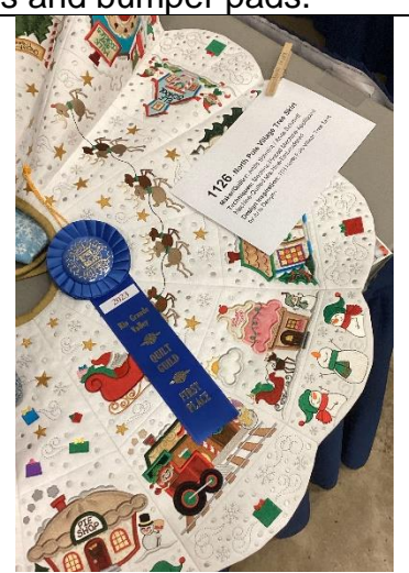
First – North Pole Village Tree Skirt by Anita Schmidt

HOME DECOR: Placemats, table runners, potholders, dolls, fabric bowls, and children's toys such as play mats and bumper pads.