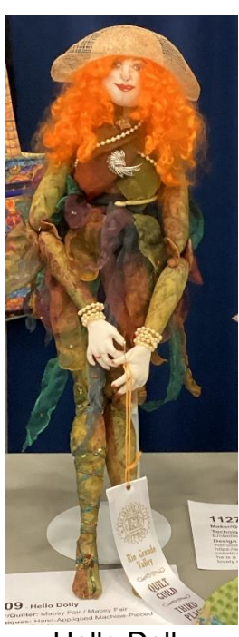
Hello Dolly By Mabsy Fair