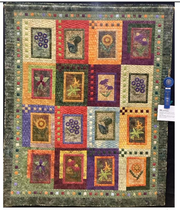
First – Wild Flowers by Jeannie Waufle

MACHINE WORK: Artistry of the machine quilting, machine embroidery, or machine applique. Over 50% must be machine work.