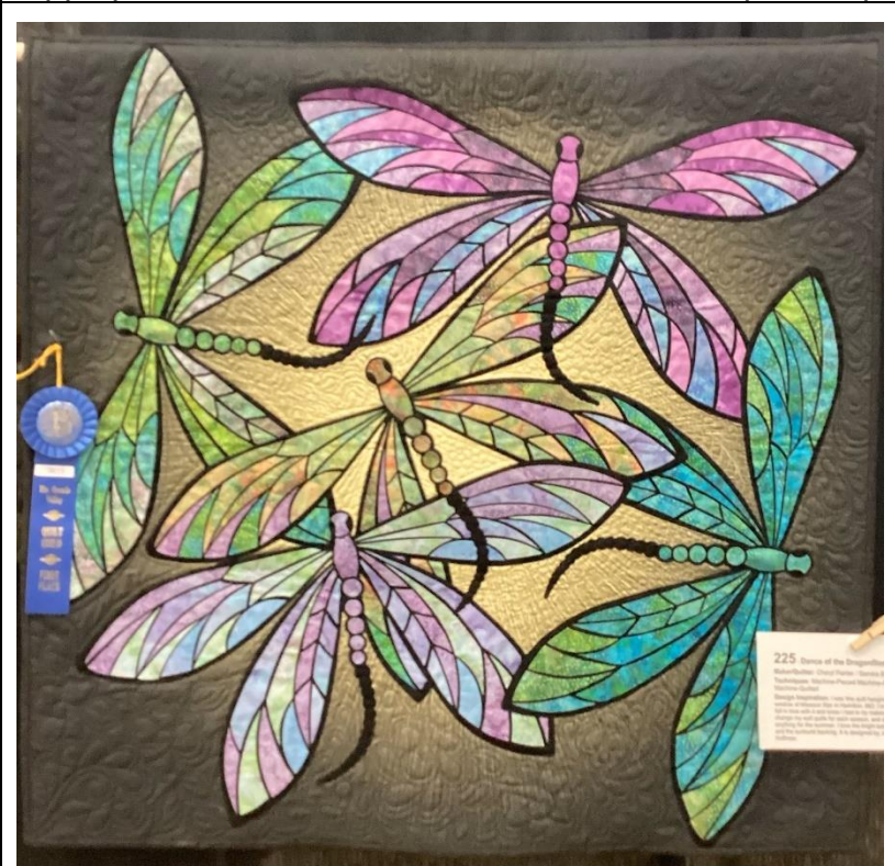
First - Dance of the Dragonflies by Cheryl Panter

LARGE WALL HANGINGS: This category includes ANY large entry that is pieced, embroidered, appliqued, whole cloth, hand and/or machine quilted specifically made to be <u>hung on a wall.</u>