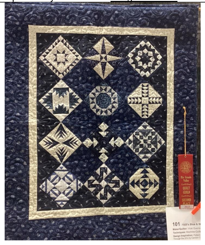
Second – 1920's Blue & White Mini Sampler By Vicki Guerra