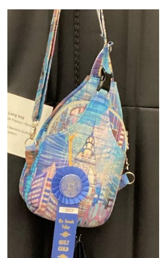
First – My Sling A Long Bag By Renee Pageau

WEARABLE: Clothing, jackets, christening gowns, skirts, vests, and accessories such as purses, bags, totes, shoes, slippers and hats.