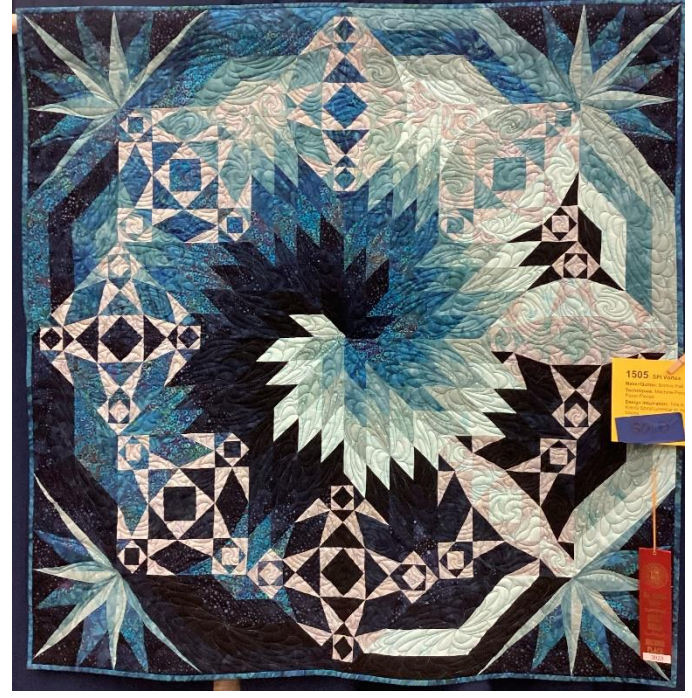
Second - SPI Vortex by Bonnie Hall