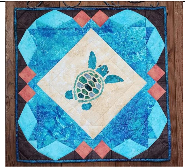
Wall Hanging - Diana South