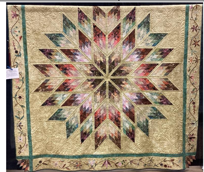
Second - Prismatic Star by Lyn Stephens