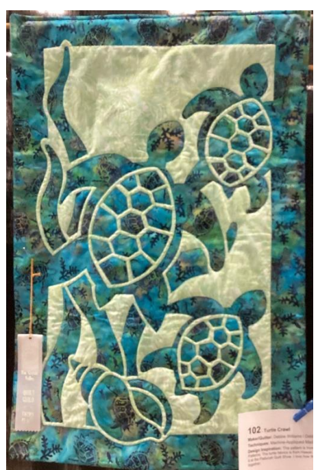
Third - Turtle Crawl