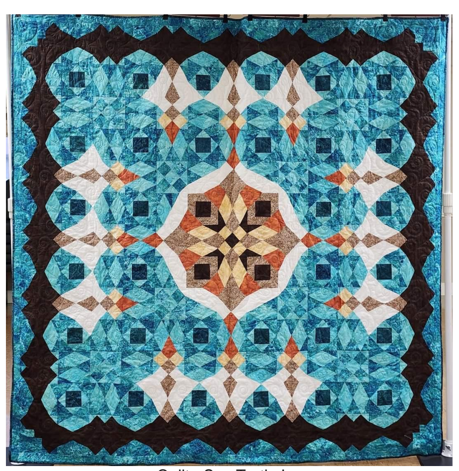
Quilt - Sea Turtle Inc