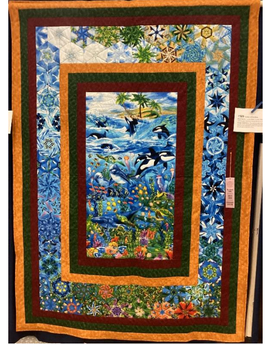
Honorable Mention Gems of the Sea by Louise Blais