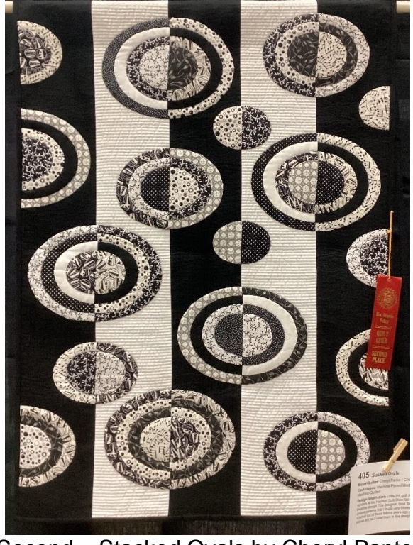
Second - Stacked Ovals by Cheryl Panter