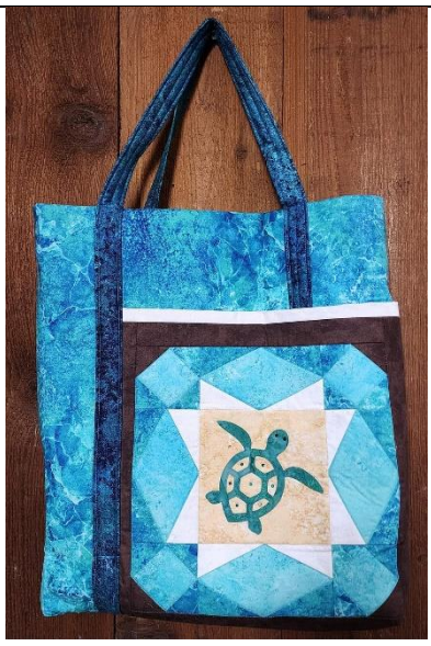
Tote – Bonita Edwards