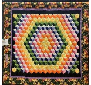
Tumbling Blocks By Pat Leonard