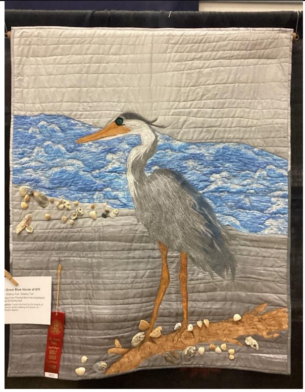
Second – The Great Blue Heron of SPI By Mabsy Fair