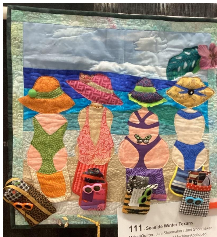
First – Seaside Winter Texans by Jani Shoemaker

SMALL WALL HANGINGS: This category includes ANY small entry that is pieced, embroidered, appliqued, whole cloth, hand and/or machine quilted specifically made to be <u>hung on a wall.</u>