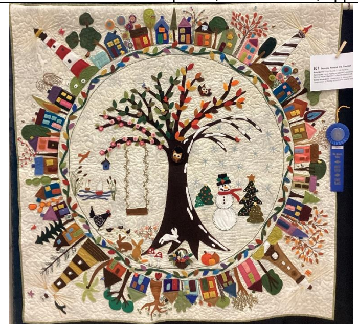
First – Seasons Around the Garden By Vicki Guerra

HAND WORK: HAND quilted, embroidered, applique, etc. Over 50% must be hand work.