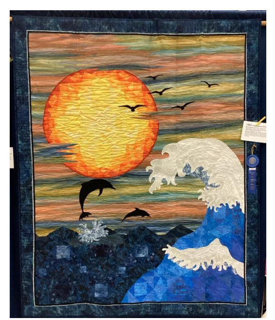
First – Puerto Vallarta Sunset by Jean Cline

2022 CHAIR'S CHOICE: "Storms at Sea" - - Any variation of a Storm at Sea pattern, and any size (as long as it is less than the maximum perimeter). "The Storm at Sea quilt pattern makes for an exciting quilt—full of movement—all due to the juxtaposition of square and rectangular blocks. Your eyes try to tell you there's curved piecing, but there's not a curved seam in the quilt!"