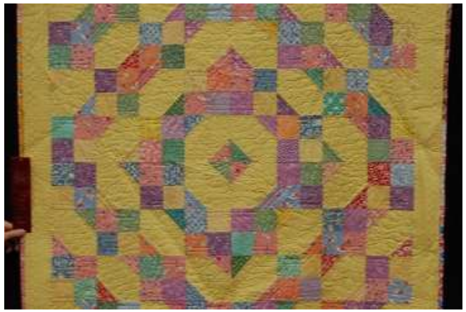
2nd - Durham, Jan - 300 - Vintage Sunshine