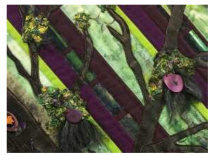
3rd - Nichol, Adelyn - 1113 - Genesis