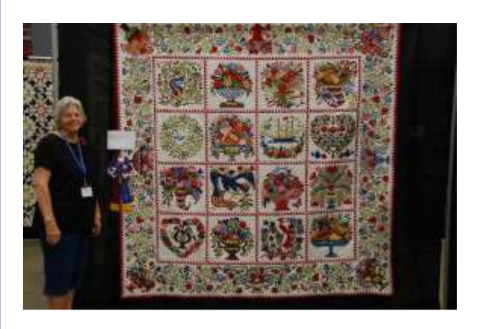
3rd - Sauter, Joyce - 618 - "Lost At Sea"