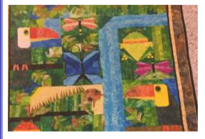
1_{\text{st}} - Cline, Jean - 310 - My Own Rain Forest