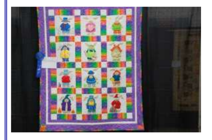
2<sub>nd</sub> - Durham, Jan - 400 - Half Square Rainbows

1st - Calufetti, Renita - 402 - Bunny Block Sampler