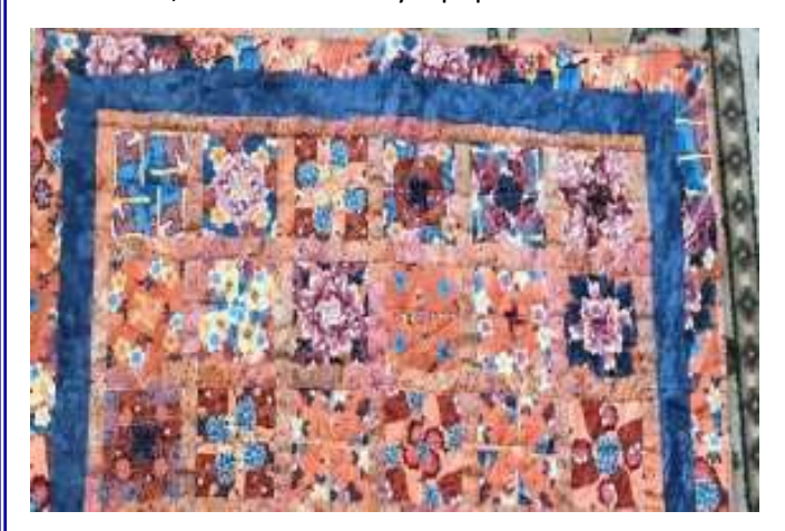
3rd - Warner, Debra - 301 - My lap quilt!