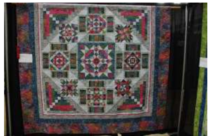
2<sub>nd</sub> - Myers, Monica - 709 - Tonga Moonlight