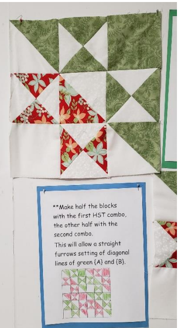
Or can do it in Red and Blue for Military Service Quilts.