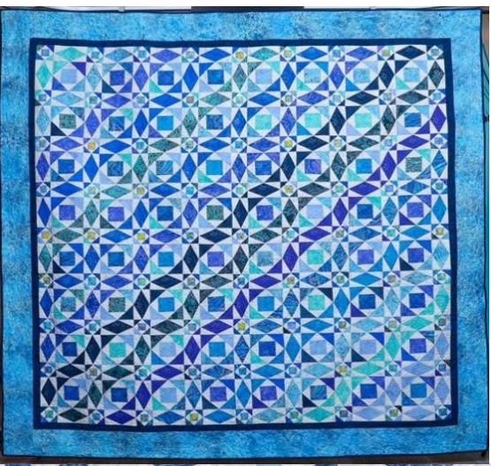
Raffle Quilt is 84"x 84".

The Greater San Antonio Quilt Guild proudly invites all lovers of art, creativity, and history, to its upcoming Quilt Show, "Weathering the Storms Together". Two hundred judged guilts will be available for your viewing pleasure along with opportunities to purchase raffle tickets for a dynamic queen size storm at sea quilt. The quilt show will also have numerous vendors who offer new and exciting textile products, a boutique with handmade finished items that make great gifts, and silent auction of finished quality quilts. The show is a family fun event, with a hunt and seek activity for youth and opportunities to learn about the history of quilting. Food trucks will be available on site and parking is free. Dates Friday September 22, 2023, 10am to 5pm Saturday September 23rd 10am to 4pm Entry tickets $12,8 and under free.