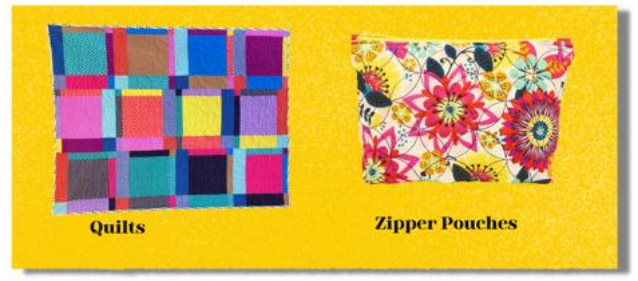
Sign Up at www.daylbags.org, click on "Do you sew?" .............................

Volunteers are needed to make 500 quilts, zipper pouches, and more. These items will be given to the youth when they graduate from high school.