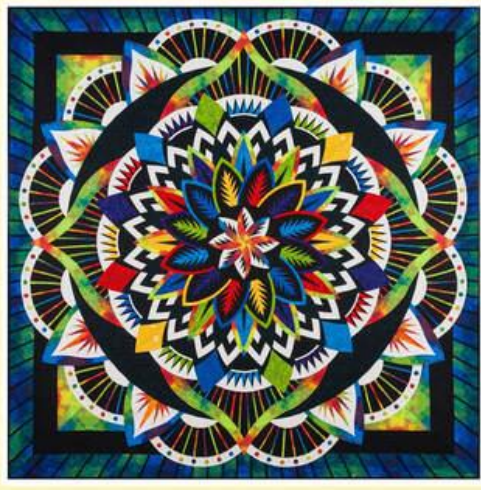
"Pcace, Love, & Flower Power" July 26-27, 2024